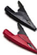
AC285-FL: Alligator Clips.