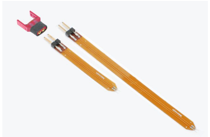
Quick Connect Flex Solder tips

The Quick Connect Flex Solder tips can bend in multiple axes allowing them to avoid obstacles on a circuit board, such as heat sinks, connectors, or tall components.