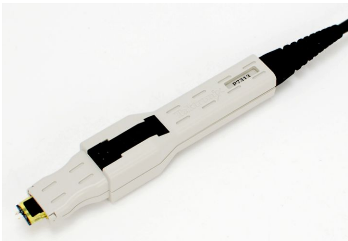
Handheld Adapter (HHA) accessory