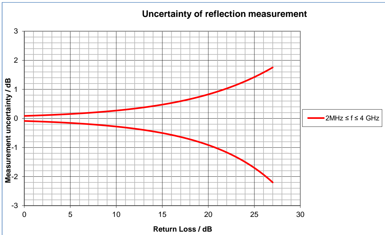
Uncertainty of reflection measurement with calibration unit R&S@ZN-Z103