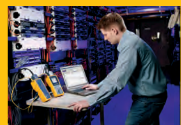
DTX-1800 with DTX 10 Gig Kit to test Alien Crosstalk performance